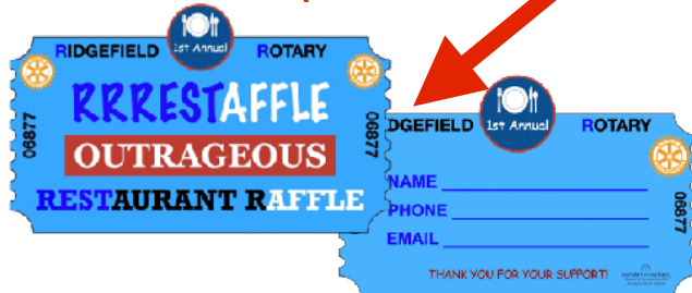
500 Paper Tickets & 1750 Online Tickets